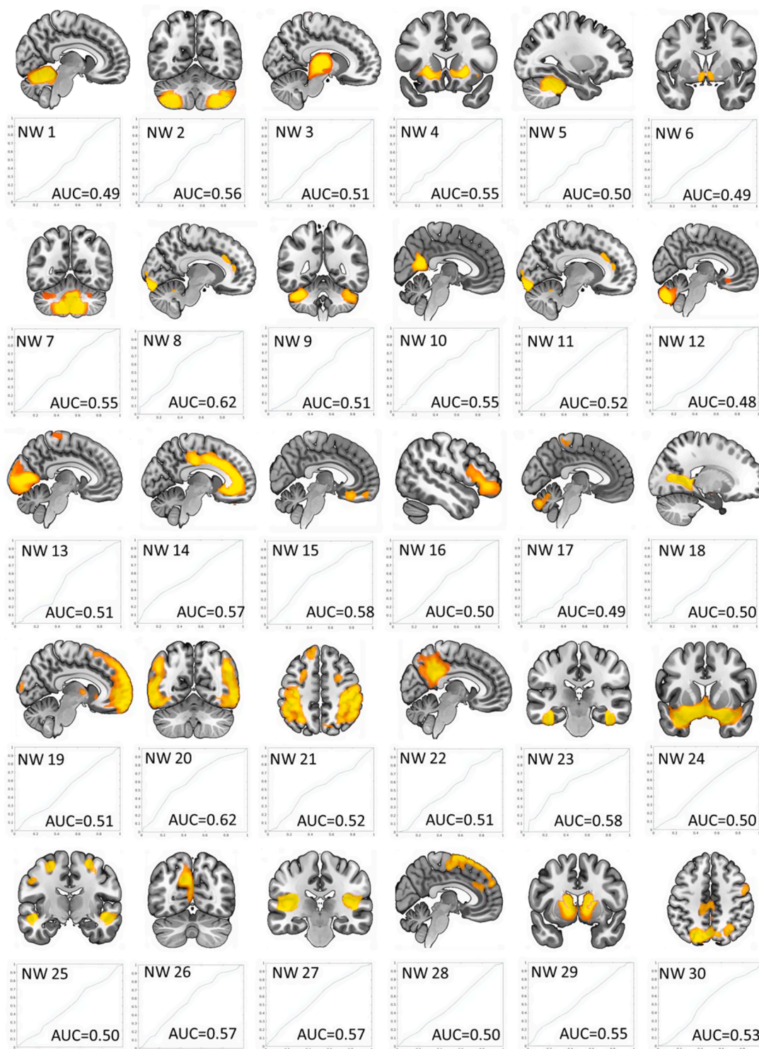
Fig. 1. ICA-derived morphometric networks (NW) with component numbers ascending from top left to bottom right and ROC curves with AUC values for each network. The x- and y-axes of the ROC curves contain values ranging from 0 to 1 with the y-axis showing the true positive rate (i.e., sensitivity) and the x-axis illustrating the false positive rate (i.e., 1-specificity).

significant differences in grey matter volume between the networks.