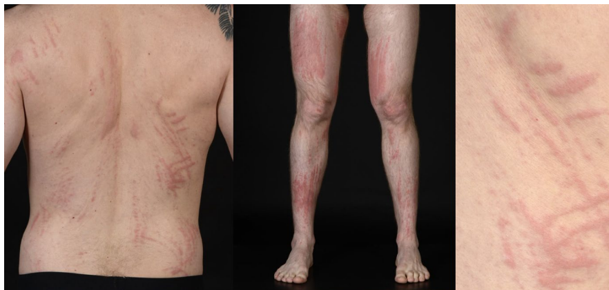
FIGURE 1 Widespread curvilinear and cross-hatched erythematous streaks present over the trunk A, and lower limbs B, without urticaria. C, The characteristic “flagellate” pattern of dermatitis on the back