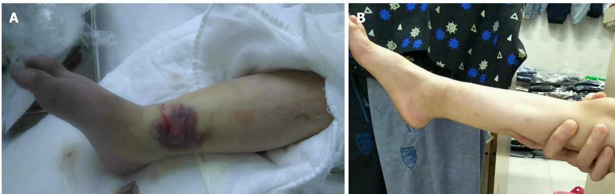
Figure 1 Typical case 1. A: A 19-mo-old child had cyanosis and purpling accompanied with multiple blisters at the right medial malleolus from infusion of potassium chloride + concentrated sodium chloride. In addition, swelling of the distal two-thirds of the right leg and dorsum pedis, as well as cyanosis at the dorsum pedis and toes, were found; B: Results at 17 mo after treatment.

scapulohumeral periarthritides, keloids, and chronic prostatitis[28-30] and for infusion infiltration as well[10,20,31]. At our hospital, local blockage is routinely performed using dexamethasone, lidocaine, and normal saline.