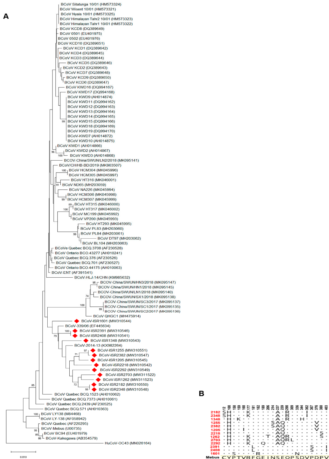
Figure 3. Phylogenetic tree of the Hemagglutinin Esterase (HE) gene of Bovine coronavirus (BCoV). Local isolates. (A) Local strains' (labeled in red) alignment with selected reference BCoV HE sequences. Phylogenetic tree was generated based on full HE gene sequences. Phylogenetic trees were generated via the neighbor-joining method with bootstrap analysis (1000 replicates, >70%). The scale bar shows the number of substitutions per site. We used HCoV OC43 as an outgroup strain. HE sequences retrieved from GenBank and embedded in the figure for each strain. (B) Deduced amino acid sequences of local isolates aligned to reference strain Mebus. Amino acid alignment showing only disagreements residues compared to reference strain Mebus.