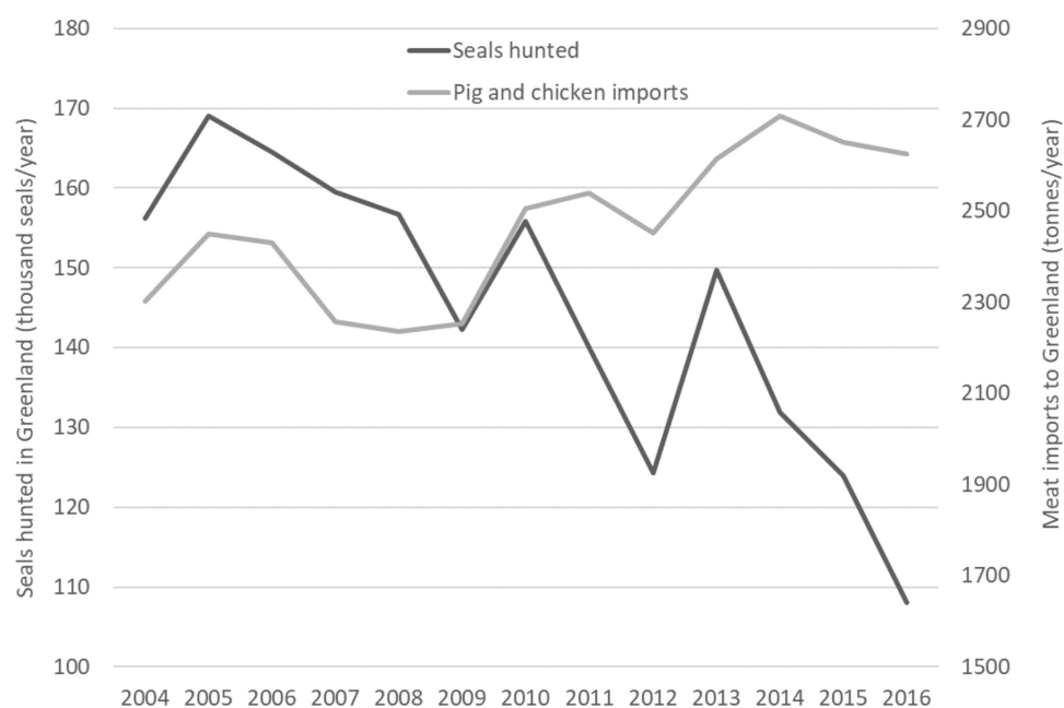
Figure 1. Seal hunting and imports of livestock products to Greenland between 2004 and 2016. Data from Piniarneq hunting database at the Ministry of Fisheries, Hunting and Agriculture and Statistics Greenland ( www.stat.gl , accessed on 26 March 2021).

Here, we evaluate the environmental implications of this shift in Greenlandic animal-source food consumption and perform a first exploratory analysis of the sustainability of locally hunted seal meat vs. imported livestock products. We do this by using the life cycle assessment (LCA) method to quantitatively compare the greenhouse gas emissions of the alternative supply chains and qualitatively discuss a number of additional aspects relevant for supply chain sustainability assessment. The results of this work point to the role food policies play in influencing dietary shifts and the sustainability of the system. While this research arguably only represents an exploratory step in the comprehensive analytical work required to understand the sustainability of global food chains, the intention is to demonstrate the importance of comparing alternative food sources in shifting diets and to point to future research needs.