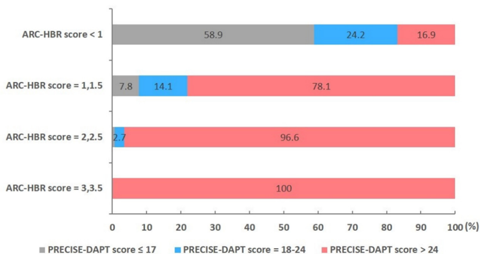
Figure 3. Distribution of risk categories for the PRECISE-DAPT score according to different ARC-HBR scores. ARC-HBR, Academic Research Consortium for High Bleeding Risk criteria; PRECISE-DAPT, Predicting Bleeding Complication in Patients Undergoing Stent Implantation and Subsequent Dual Antiplatelet therapy.