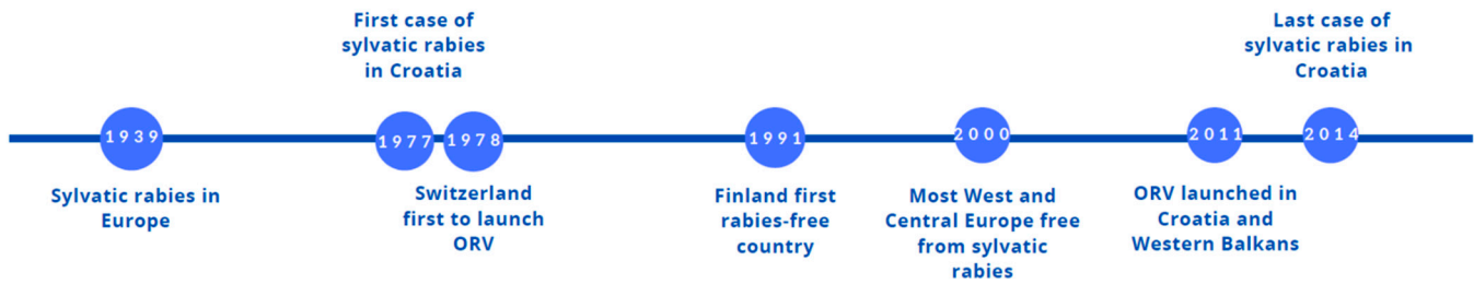
Figure 2. Timeline of the most important events related to the elimination of sylvatic rabies in European territory.