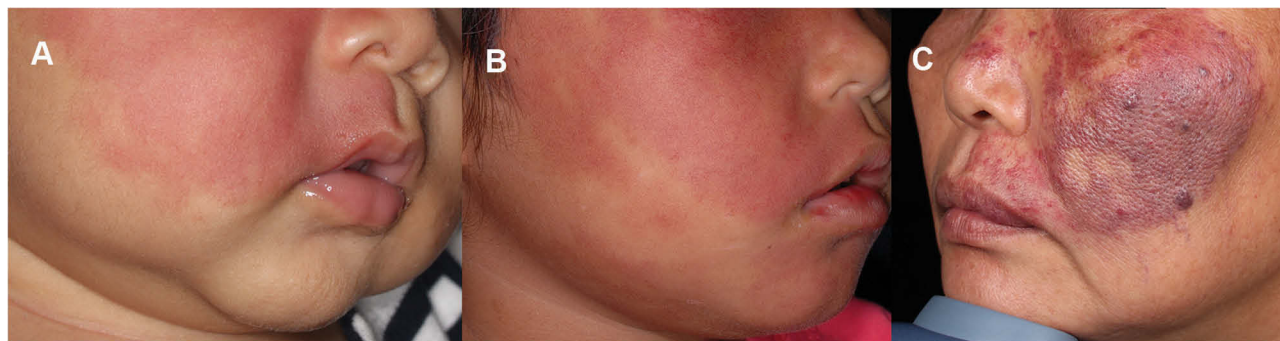
Figure 1 Clinical photographs of facial PWS among patients. Clinical photographs of facial PWS among patients in different age groups (A) a 4-month infant (B) a 5-year old child and (C) a 51-year old woman.

Management of a patient with PWS involves a holistic approach, which includes extensive family support. As much as we want to recommend early treatment, the common dilemma of parents includes weighing the possible future social risks of PWS against the pain of laser therapy and its costs. 4 It was reported that parents of children with facial PWS had lower stress when they had younger children, more family cohesion and adaptation, fewer parental concerns, and greater satisfaction with parent-staff communication. 13 This study suggests the importance of having a clear and comprehensive communication, which is sensitive to the psychological needs of the patients and the parents.