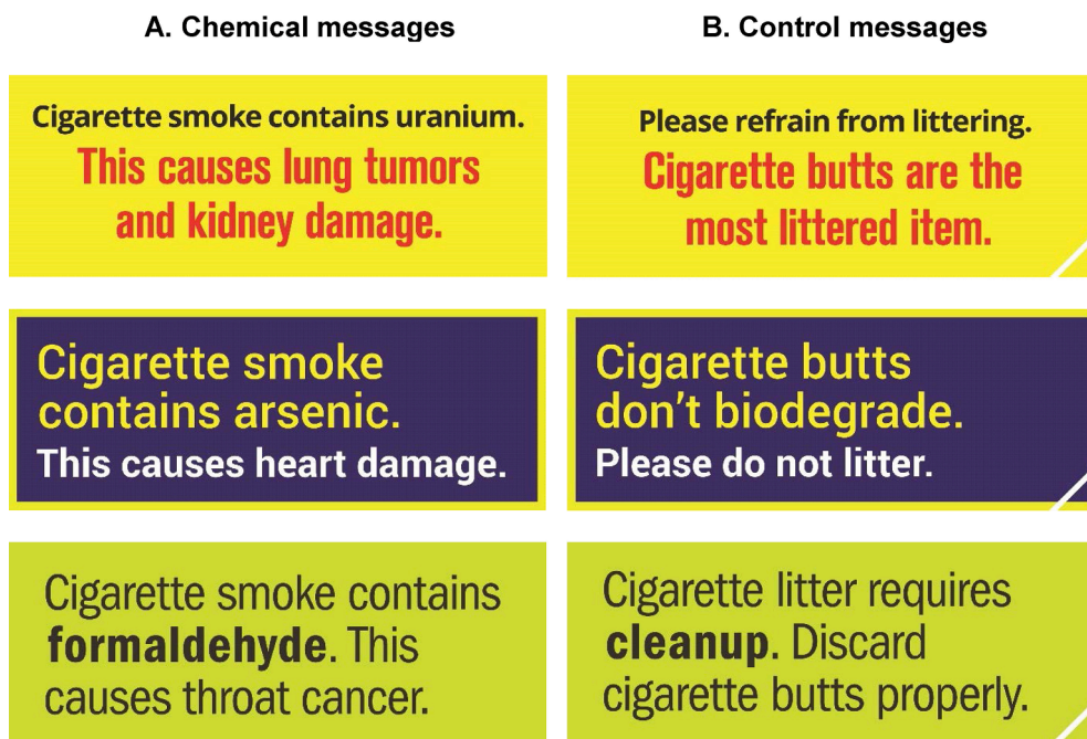
Fig. 1. Messages placed on smokers' cigarette packs in the intervention (A) and control (B) arms.

avoidance with negative affect), further underscoring their importance. The survey assessed avoidance ( \alpha = 0.89 ) and quit intentions ( \alpha = 0.96 ) using separate three-item scales with desirable psychometric properties. The other five outcomes were assessed using single-item measures (Table 1).