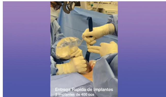
Video 3. Watch now at http://academic.oup.com/asjopenforum/article-lookup/doi/10.1093/asjof/ojab012

This technique elucidates the importance of considering innovative options during breast augmentation or reconstruction procedures. The double loading procedure can be implemented easily in plastic surgery practices and the authors hope the videos provide an educational example of the technique that can be adopted by surgeons who use protective funnels. Informed