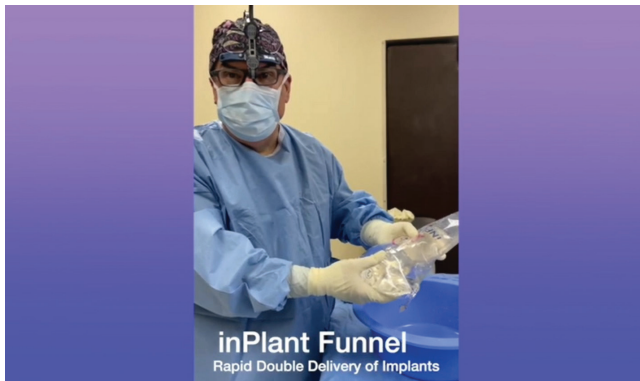
Video 2. Watch now at http://academic.oup.com/asjopenforum/article-lookup/doi/10.1093/asjof/ojab012

of the implant into the funnel such that the seal patch is visible in the proper position, especially for smaller-sized implants.