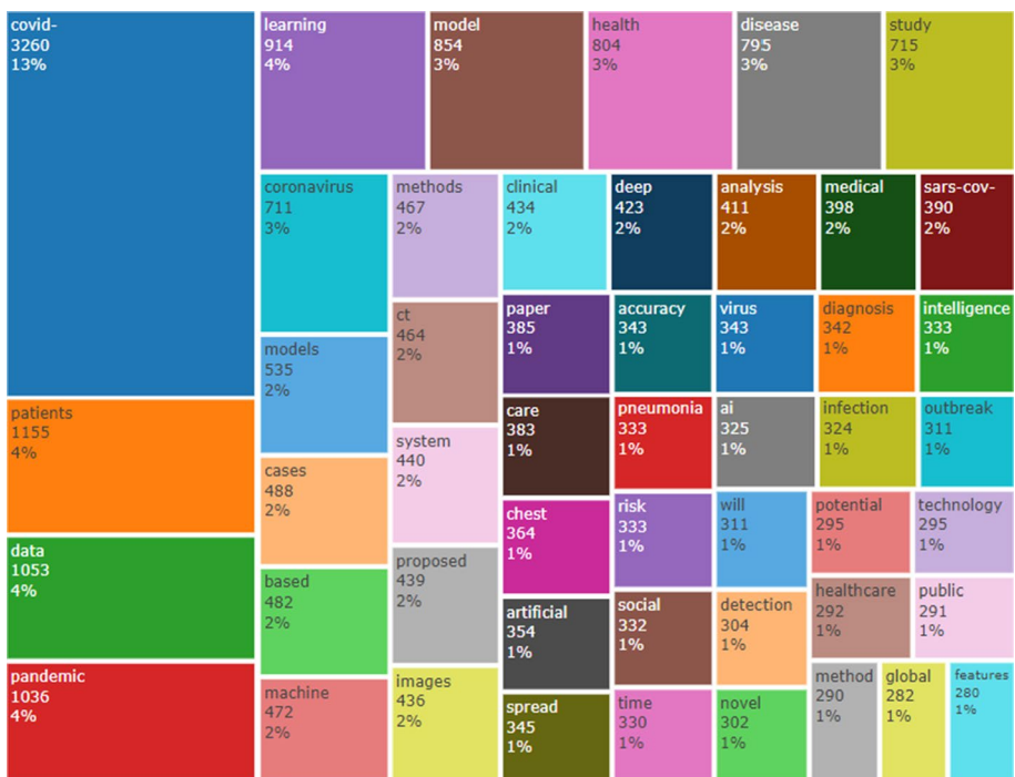
Fig. 1 Treemap based on abstracts

To finalize the analysis of the keywords dynamics, in Fig. 1 we present a Treemap taking into account the abstracts. The size rectangle denotes the frequency of the term. In this vein, “covid”, “patients”, “data”, “pandemic”, and “learning”, were the most frequent topics. Regarding the emerging technologies outlook, we recognize that related topics like “data”, “learning”, “models”, “machine”, “methods”, “system”, “artificial”, “deep”, “accuracy”, “analysis”, “ai”, “detection”, “intelligence”, achieved good participation. Therefore, it bolsters the suggestion that emerging technologies play an essential role to tackle epidemic outbreaks and other emergency situations.