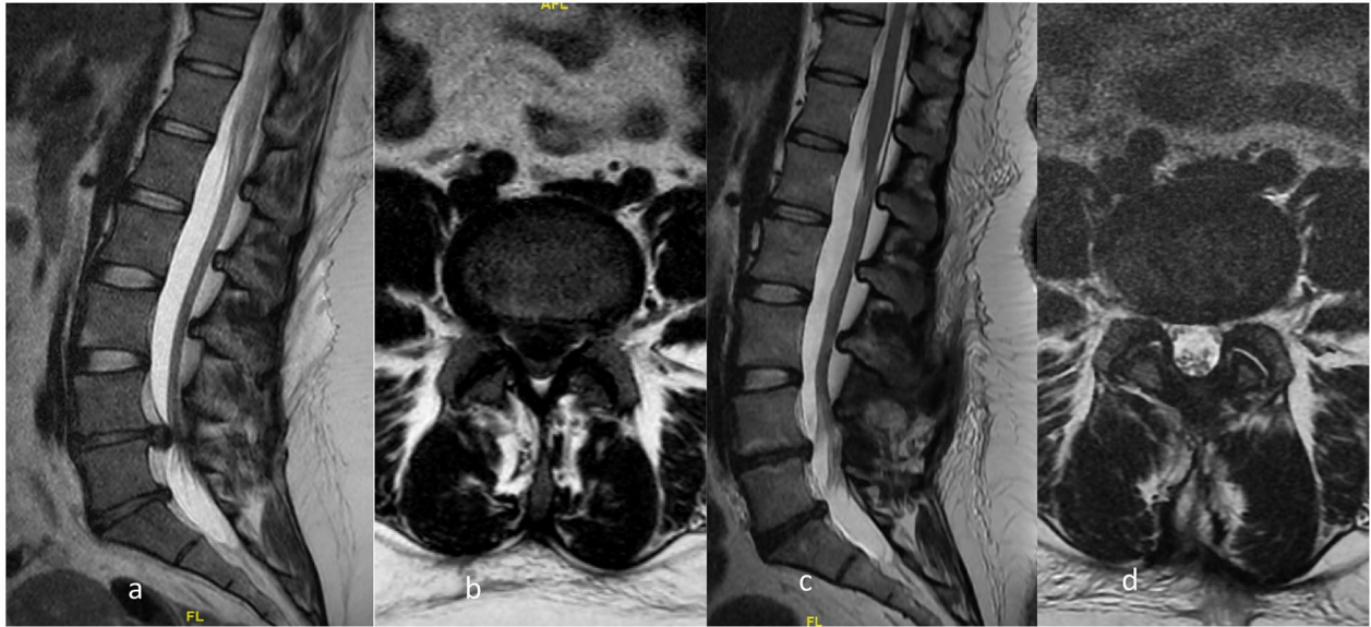
Fig. 3 A 28-year-old female patient presented with acute onset back pain and bilateral leg numbness. Altered sensation over perianal area and perineal area with urinary retention. (a, b) Magnetic resonance imaging (MRI) demonstrated a herniated disc at L4/5 level. (c, d) the patient had L4/5 discectomy, and this is the postoperative MRI at 12 months.