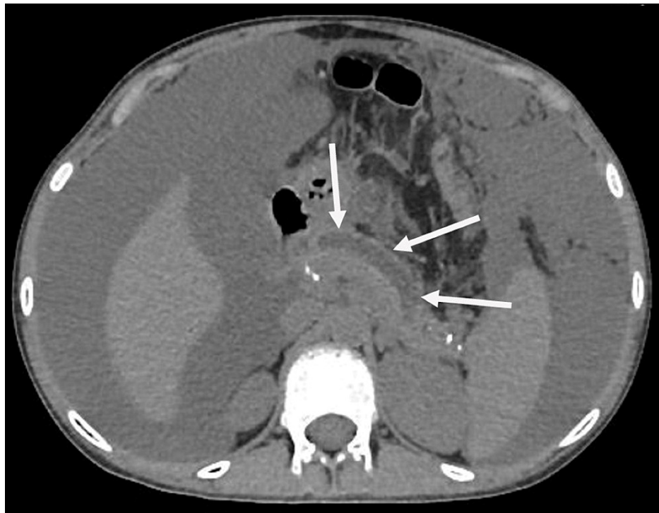
FIGURE 1: CT abdomen showing pancreatic inflammation and edema (white arrows).