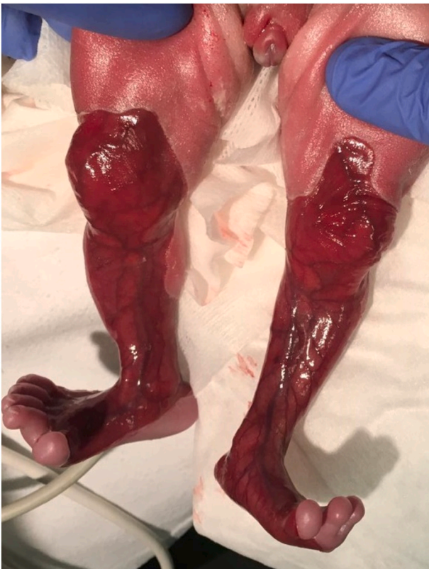
Fig. 2. Aplasia cutis congenita on knees, lower legs and feet.