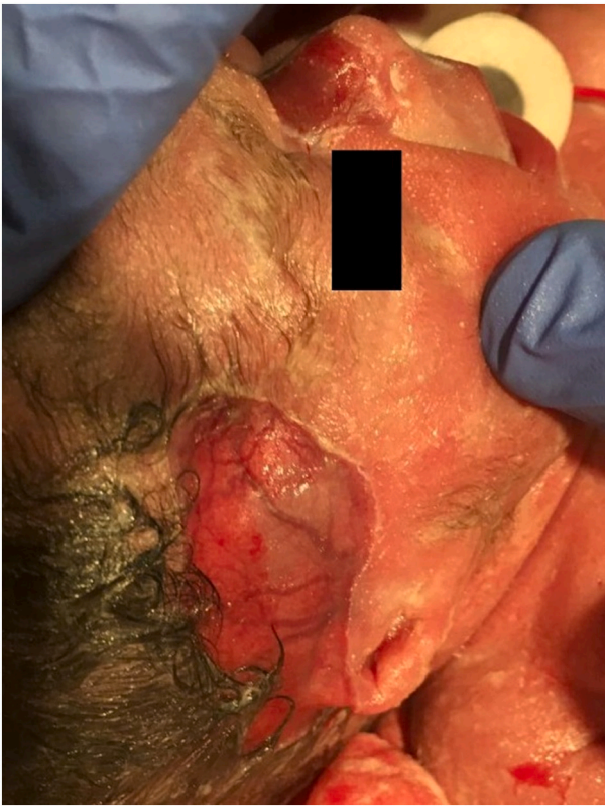
Fig. 1. Aplasia cutis congenita on temple and nose and mutilated right ear. The photograph was taken shortly after birth.