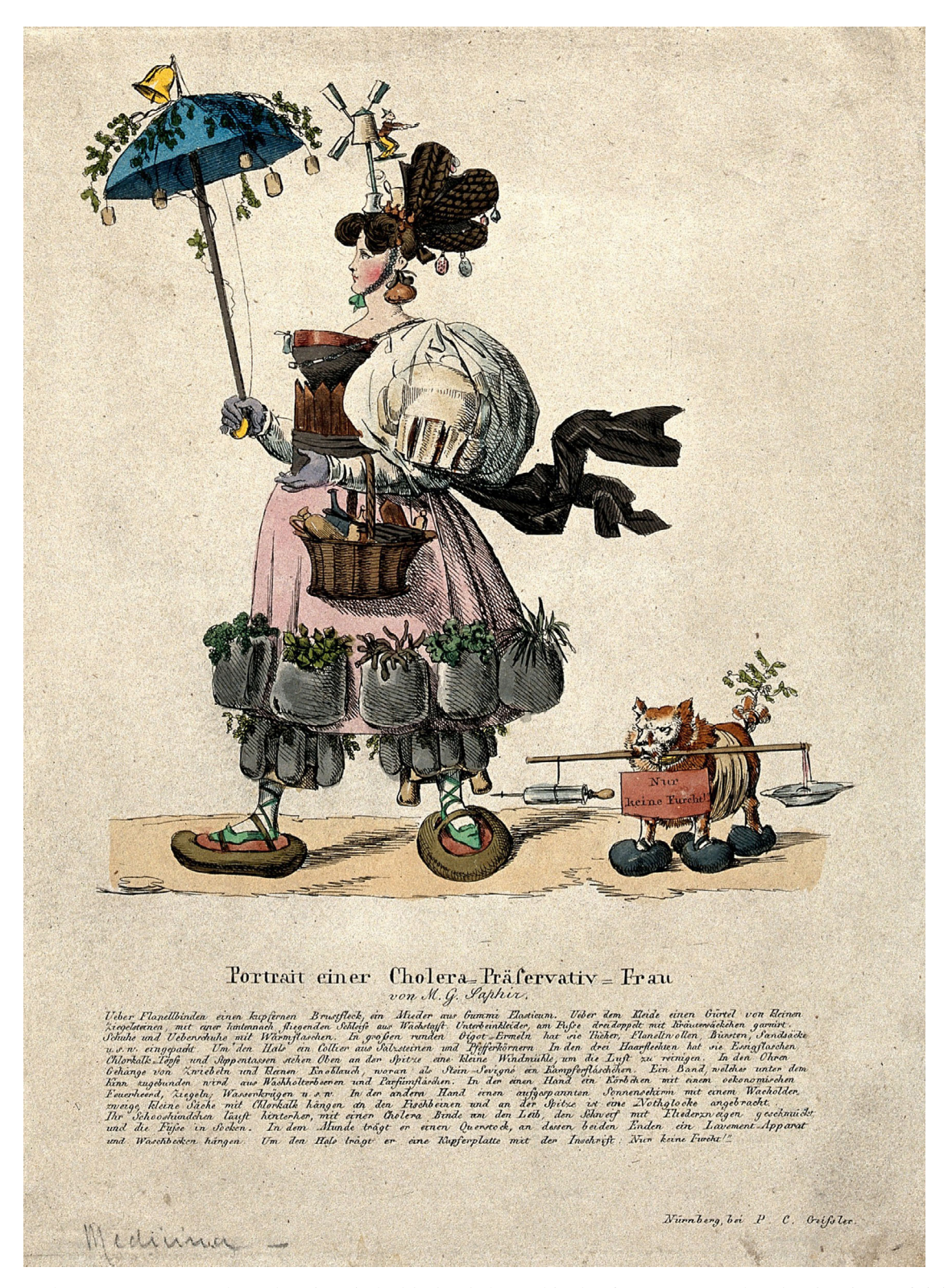
Fig. 3. A woman extravagantly equipped to deal with the cholera epidemic of 1832; representing the abundance of dubious advice on how to combat cholera. Etching, c. 1832. Moritz Gottlieb Saphir (1795–1858).