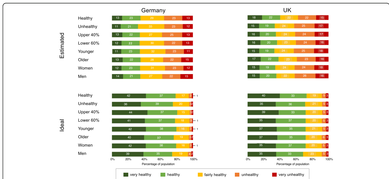
Fig. 2 Estimated and ideal national distributions of health by the five health categories for demographic groups in Germany and the United Kingdom. Note: The groups were categorized as follows: Healthy (very healthy, healthy) vs. Unhealthy (fairly health, unhealthy, very unhealthy) based on self-rated health (Germany n = 266 vs. n = 56 , UK n = 143 vs. n = 304 ); Upper 40% vs. Lower 60% based on self-rated wealth (Germany n = 53 vs. n = 236 , UK n = 192 vs. n = 249 ); Younger vs. Older based on median cut on age (Germany \leq 25 vs. > 25 ; n = 164 vs. n = 158 ; UK \leq 32 vs. > 32 ; n = 233 vs. n = 213 ); Women vs. Men (Germany n = 236 vs. n = 85 ; UK n = 315 vs. n = 130 )

In a series of additional analyses, we tested the hypothesis that there is a consensus across demographic groups