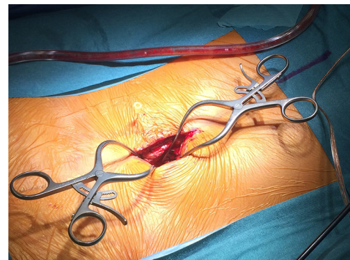
Figure 3 Intraoperative view during surgical dissection. The needle introduced on the opposite side of the hernia helps finding the good way during microdiscectomy as a “navigation-like” device.

The microdiscectomy level was L5-S1 for 15 (50%), L4-L5 for 11 (36.7%), L3-L4 for 2 (6.7%) and L2-L3 for 2