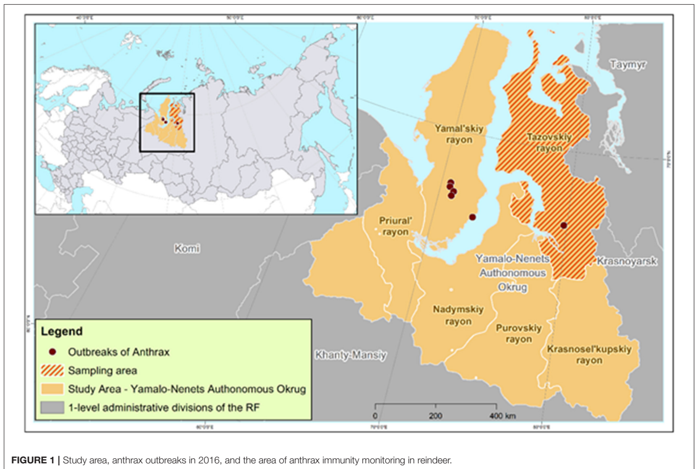
FIGURE 1 | Study area, anthrax outbreaks in 2016, and the area of anthrax immunity monitoring in reindeer.

messages.html) that were notified by Russia to OIE ( https://wahis.oie.int/#/dashboards/country-or-disease-dashboard ). The data contained information on the infected species, exact location of the outbreaks, and the number of infected and dead animals. This information was represented as a shapefile to enable mapping and spatial analysis in a geographic information system (GIS).