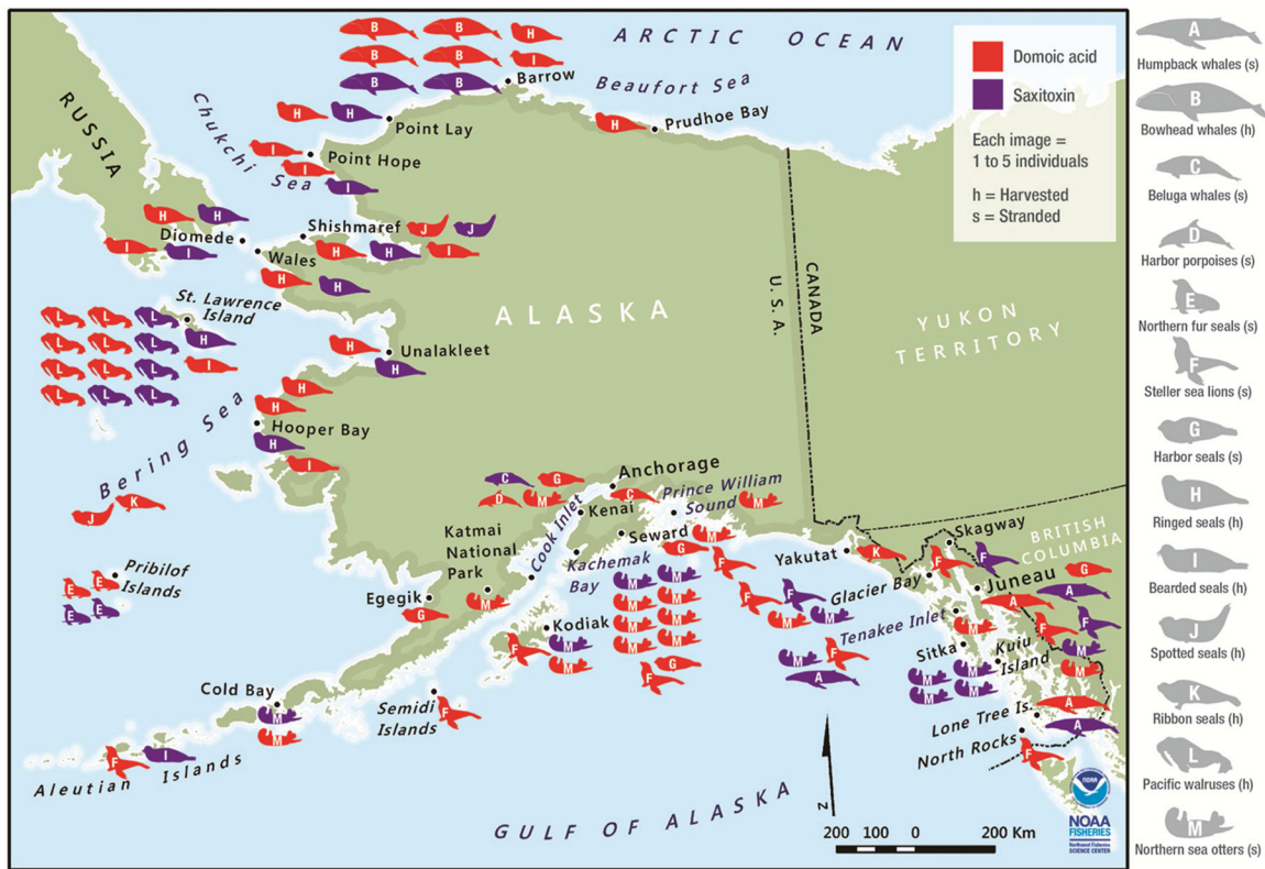
Fig. 1. Locations where algal toxins were detected in stranded (s) and harvested (h) marine mammals. Red images represent species positive for domoic acid (DA) and purple images represent species positive for saxitoxin (STX). Marine mammal species are listed as follows; A) Humpback whales, B) Bowhead whales, C) Beluga whales, D) Harbor porpoises, E) Northern fur seals, F) Steller sea lions, G) Harbor seals, H) Ringed seals, I) Bearded seals, J) Spotted seals, K) Ribbon seals, L) Pacific walruses, and M) Northern sea otters.