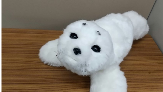
Figure 1. PARO.

administered by trained HCPs. The only research conducted within one's natural environment did not look into the effects of using PARO solely at home as it was a combination of daytime PARO use in a day-care center and home. 11 As PARO can potentially serve as a medium in improving the drive of individuals caring for persons with dementia, it is of benefit to consider PARO use in diminishing stress among family members while contributing to the extension of community living among older persons with dementia, thereby becoming one of the solutions to providing high-quality home care. 12