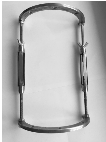
Figure 1. The exterior of advanced rod monolateral apparatus of external fixation.

system. Application of this technology in lengthening limb segments allows reaching the stability of the device in the distraction process providing a strong and even regenerate. The best results have been achieved in terms of fixation time, length of the regenerate, deformation angles (ante-curvature, valgus, and varus), pain intensity indicators, and complications. The outer supports of the rod external fixator with improved control distraction system are quite small in size and lightweight. Besides, being highly stable, they provide good psychological tolerance of the treatment process and demonstrate a significant advantage over the circular multi-axis system. Taking into account the low cost of described fixation system, it can contribute to the provision of good orthopedic care in achondroplasia patients.