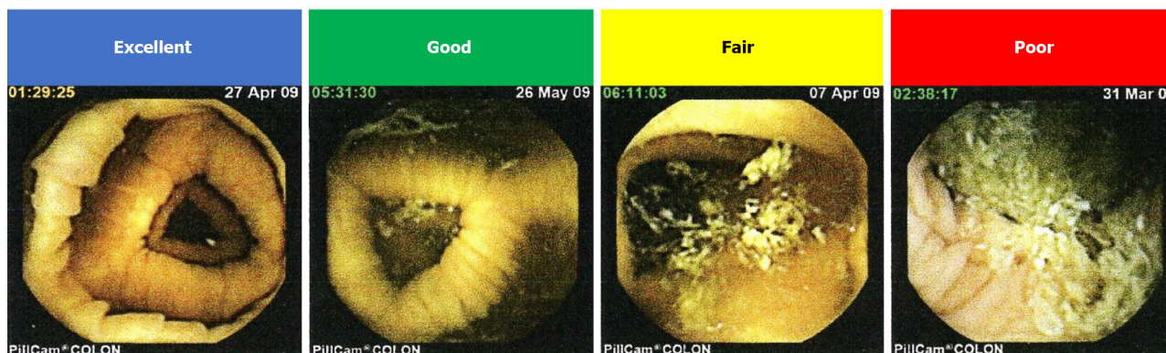
Figure 2 Degree of the colon cleansing level in different segments of the colorectum (cecum, ascending colon, transverse colon, descending-sigmoid colon, and rectum).