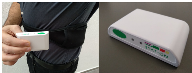
Figure 1 Parkinson's Holter.

The first report (figure 2) shows a summary of the data obtained from the patient during the time monitored, including the number of freezing of gait episodes detected and the percentage of time in On, in Off and in status intermediate between the two. The graph shown in figure 3 is the most important for clinicians, since it shows the time course of the different motor symptoms, over