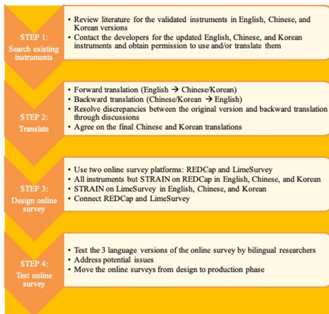
Figure 2 Multilingual survey development and testing process.