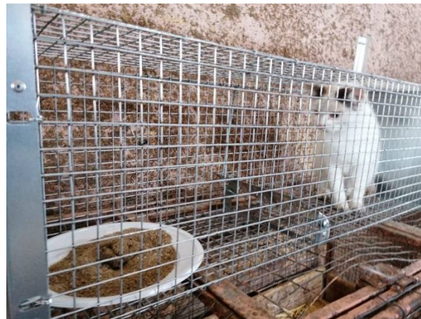
Figure 1. Confinement of a cat by using a trap cage.