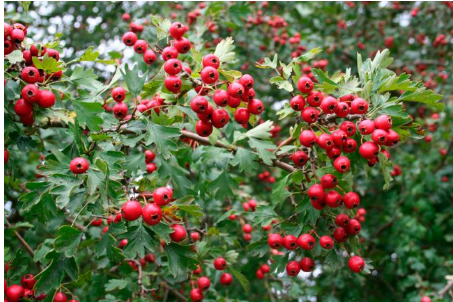
Figure 4. Hawthorn ( Crataegus oxyacantha L.) photo.

Regarding vasorelaxation activity, WS 1442 potentiates NO secretion from the endothelium by activating Src/PI3-kinase/Akt-dependent phosphorylation, which results in endothelial nitric oxide synthase (eNOS) phosphorylation [? ]. Procyanidines from Crataegus oxyacantha L. and Crataegus monogyna Jacq. have also been shown to open BK Ca channels in vascular smooth muscle cells to promote hyperpolarization and, consequently, vasorelaxation [? ]. Third, WS 1442 activates nitric oxide synthase specific to red blood cells (rbcNOS) [? ], which may also justify this vasorelaxation activity. Finally, it has also been hypothesized that WS 1442 inhibits the angiotensin-converting enzyme [? ]. These activities seem to underlie other results, showing that WS 1442 protects against ischemia/reperfusion (I/R) injury in the myocardium as well as consequent arrhythmias [? ? ? ].