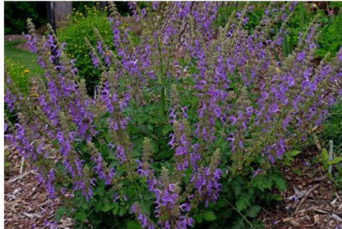
Figure 11. Salvia miltiorrhiza L. photo.

Salvia miltiorrhiza Bunge (Lamiaceae), also known as “Danshen” in China (Figure ??), is an aromatic perennial herb distributed in China and Japan. The roots, rhizomes, stems, and leaves of Salvia miltiorrhiza Bunge have been used in traditional Chinese medicine to treat numerous diseases, especially CVD [? ]. The principal bioactive components in this herb are diterpenoids, namely tanshinones, and phenolic acids such as salvianolic acids [? ]. Salvia miltiorrhiza Bunge plays a beneficial role in microcirculation by protecting the endothelium due to its vasodilator and anti-inflammatory activities and to its modulation ability in angiogenesis.