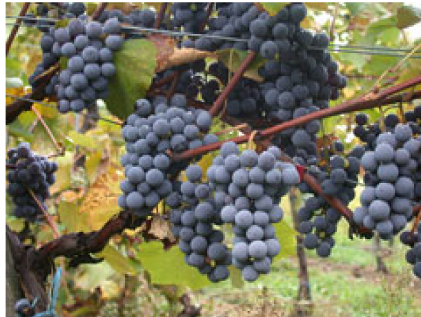
Figure 9. Vitis vinifera L. photo.

Vitis vinifera L. extract protects the endothelium against oxidative stress in vitro [? ]. Additionally, it potentiates endothelial-dependent vasorelaxation, probably by increasing NO synthesis [? ]. In animals, an extract of unripe grape is able to decrease blood pressure in response to the administration of angiotensin II [? ]. Furthermore, in several animal models, Vitis vinifera L. extract is able to decrease vascular permeability due to its anti-inflammatory activity, namely the inhibition of NO and prostaglandins by leucocytes, which is attributed to the suppression of the NF- \kappa B pathway [? ]. This anti-inflammatory activity justifies the clinical improvement of patients with PVD, namely skin perfusion [? ]. Finally, Vitis vinifera L. has antiangiogenic activity, as it inhibits the secretion of the pro-angiogenesis factor VEGF in vitro [? ? ].