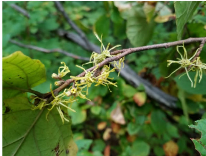
Figure 8. Hamamelis virginiana L. photo.

shows important astringent, anti-inflammatory, and local hemostatic effects, which justify its ancestral tradition for the treatment of skin and mucosal diseases, such as hemorrhoids, PVD, and dermatitis [? ? ?]. The leaves and bark of Hamamelis virginiana L. are used for therapeutic purposes, and their extracts are composed of tannins, gallic acid, flavonoids (e.g., catechins, proanthocyanins), saponins, and essential oils. Flavonoids and tannins are the main bioactive compounds with important antioxidant activity, together with gallic acid. Tannins also appear to be responsible for astringent and hemostatic properties and enhance tissue regeneration [? ?].