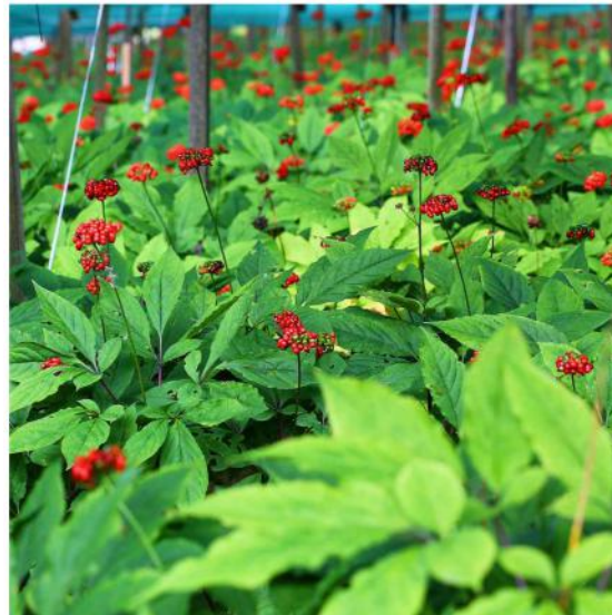
Figure 6. Panax ginseng C.A. Meyer photo.

Panax notoginseng (Burkhill) F. H. Chen also improves microvascular dysfunction under inflammatory conditions. Upon lipopolysaccharide action in the rat mesentery, the saponin fraction decreases vascular leakage, leucocyte adhesion, mast cell degranulation, and cytokine production [? ?]. Saponosides from Panax ginseng C.A. Meyer are also known to protect against homocysteinemia-mediated endothelial and vasomotor dysfunction [? ], again due to the effect of ginsenoside Rb1 [? ?].