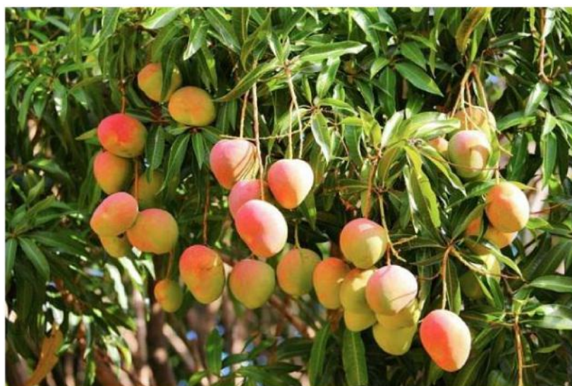
Figure 12. Mangifera indica L. photo.

In a human pilot study, a powder supplement containing 100% of the Mangifera indica L. fruit improved microcirculation by potentiating the reactive hyperemia response, an effect which was attributed to the increase in eNOS expression, as observed in the endothelial cells in vitro [? ]. Another study showed that the same extract was able to improve the reactive hyperemia evoked in the postprandial state after a high glucose intake, a factor known to impair the endothelium [? ]. To our knowledge, no adverse effects related to the Mangifera indica intake have been reported.