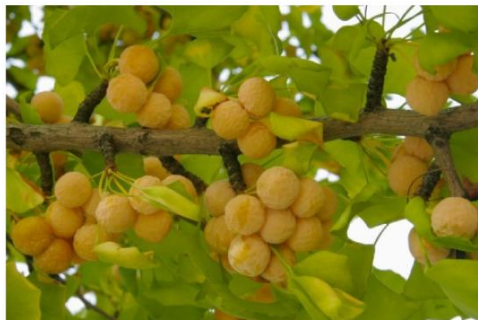
Figure 10. Ginkgo biloba L. photo.

Ginkgo biloba L. (Figure ??) is the oldest tree in the world and has gone unchanged for approximately 270 million years. It has no living relative in existence, which is why it has its own division, Ginkgophyta. Ginkgo leaves have been used in traditional Chinese medicine for hundreds of years, and are the source of a currently-made standardized extract that is among the top five best-selling herbal products. Its leaves contain terpene trilactones (ginkgolides and bilobalides) and flavonoids (quercetin and kaempferol), among other compounds [? ].