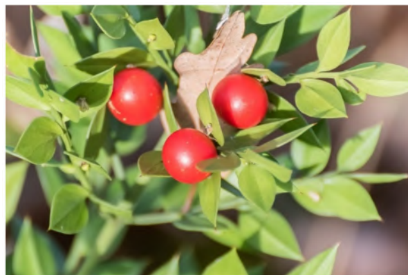
Figure 3. Ruscus aculeatus L. photo.

Ruscus aculeatus L. (Asparagaceae) (Figure ??), also known as Butcher's broom is a low evergreen shrub and features in many dietary supplement patents. Its root is used as a phytotherapeutic product, even though its aerial parts are edible [? ]. The bioactive compounds identified in the Ruscus aculeatus L. extracts include saponins (ruskogenin, neuruskogenin, ruscin, ruscocide), flavonoids, sterols (sitosterol, stigmasterol, kempesterol), tyramine, coumarin, triterpens, lignoceric acid, glycolic acid, and benzofuranes [? ]. The beneficial effects of Ruscus aculeatus L. on microcirculation include its endothelial-protecting and venotonic activities.