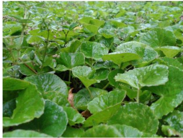
Figure 5. Centella asiatica L. photo.

These triterpenoids also display antioxidant activity, namely on the endothelium [? ], which, together with their antiplatelet activity, contributes to protecting against I/R injury, for example, in the brain [? ].