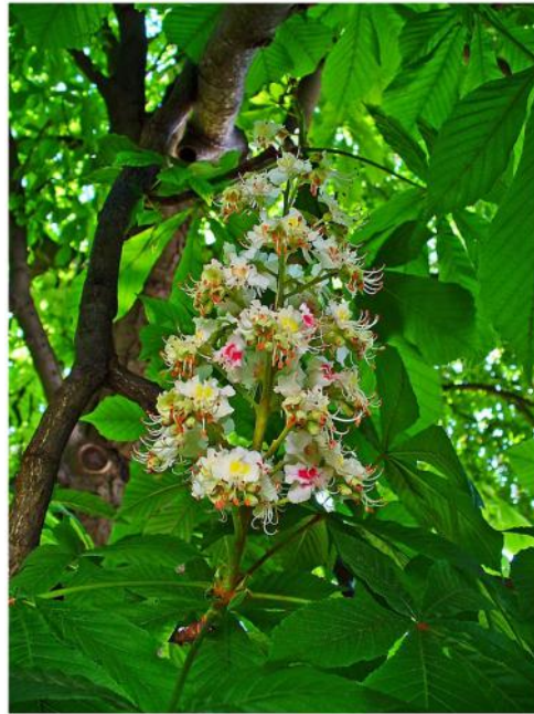
Figure 7. Aesculus hippocastanum L. photo.

which have been employed for the treatment of venous insufficiency, including PVD and hemorrhoidal disease [? ].