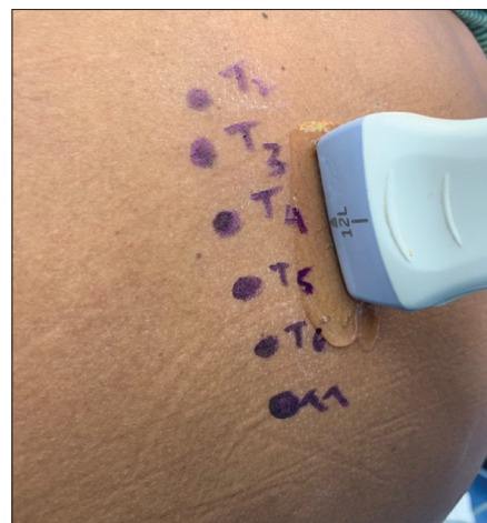
Figure 1: Surface landmarks and probe position

The probe was placed 3-4 cm in parasagittal position at the back in the cephalad-caudal direction at the T4-T5 transverse process on the operative side. Parietal pleura