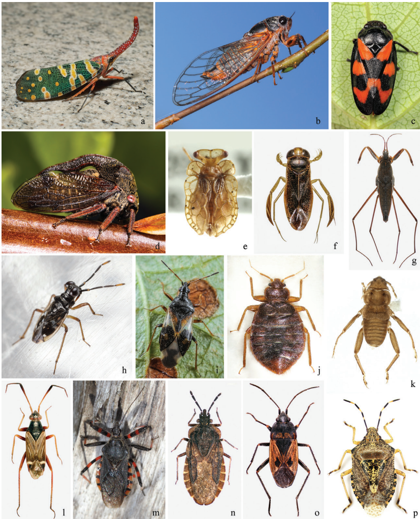
Figure 2. a–p Species from main taxonomic groups of Paraneoptera insects (continuation) a Pyrops candalaria (Linnaeus, 1758) (Cicadinea, Fulgoridae), photo and “Creative Commons” license of “Sterling Sheehy” (see Acknowledgements) b Cicadetta montana (Scopoli, 1772) (Cicadinea, Cicadidae), photo of E.Yu. Kirtsideli, PhD c Cercopis vulnerata Rossi, 1807 (Cicadinea, Cercopidae), photo of E.Yu. Kirtsideli, PhD d Centrotus cornutus (Linnaeus, 1758) (Cicadinea, Membracidae), photo of E.Yu. Kirtsideli, PhD e Pantinia darwini China 1962 (Coleorrhyncha, Peloridiidae), photo and “Creative Commons” license of “Sterling Sheehy” (see Acknowledgements) f Glaenocoris propinqua (Fieber, 1860) (Heteroptera, Corixidae), photo of D.A. Gapon g Gerris sphagnetorum Gaunitz, 1947 (Heteroptera, Gerridae) h Chartoscirta elegantula (Fallén, 1807) (Heteroptera, Saldidae), photo of E.Yu. Kirtsideli, PhD i Anthocoris nemorum (Linnaeus, 1761) (Heteroptera, Anthocoridae), photo of E.Yu. Kirtsideli, PhD j Cimex hemipterus (Fabricius, 1803) (Heteroptera, Cimicidae), photo of D.A. Gapon k Hesperoctenes fumarius (Westwood, 1874) (Heteroptera, Polctenidae), photo and “Creative Commons” license of “CBG Photography Group” (see Acknowledgements) l Cremnocephalus albolineatus Reuter, 1875 (Heteroptera, Miridae), photo of D.A. Gapon m Rhynocoris annulatus (Linnaeus, 1758) (Heteroptera, Reduviidae), photo of E.Yu. Kirtsideli, PhD n Aradus laeviusculus Reuter, 1875 (Heteroptera, Aradidae), photo of D.A. Gapon o Rhyparochromus phoeniceus (Rossi, 1794) (Heteroptera, Lygaeidae), photo of D.A. Gapon p Rhaphigaster nebulosa (Poda, 1761) (Heteroptera, Pentatomidae), photo of D.A. Gapon.