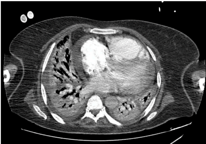
Fig. 3. Chest CT on the 52 day of support VV ECMO.

Hence the interest of a “fully-awake” ECMO strategy in this patient [8]. Indeed, unlike the data reported for COVID-19 patients with an extended support ECMO [5], our patient had only one episode of nosocomial infection, as was noted in the paper of Schmidt and al [9].