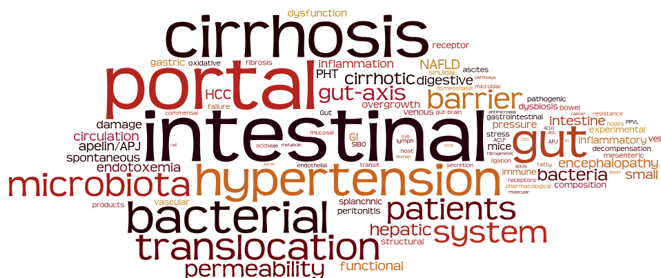
Fig. 3. Word cloud representing the most frequent keywords of abstracts with the keyword gut-liver axis. The size of the words within the word cloud correlates with the frequency of the respective word in the analysed abstract text.

The gut-liver axis has been increasingly investigated in recent years, partly thanks to technological advances in the methods used to investigate the microbiota. 104 Hence, we performed an analysis of the published literature on the gut-liver axis and portal hypertension from the last 15 years and plotted the key words (after removing the random words) in order to highlight the main findings or opinions (Fig. 3). Besides the general mechanisms of bacterial intestinal translocation, a wide