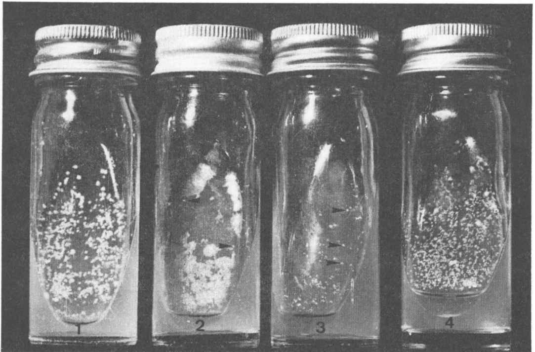
Figure 2. Subcultures of the Norwegian goat pathogenic variant of Mycobacterium paratuberculosis on Dubos' medium after approx. 8 months' incubation at 37°C. Tubes 1 and 4 contain mycobactin, while tubes 2 and 3 do not. The arrows indicate individual colonies.

Subcultures were made onto Dubos' medium with and without mycobactin from 8 primary bacterial cultures, 1 tube with mycobactin and 2 tubes without for each culture. After 12 weeks of incubation there was dense growth in the culture tubes containing mycobactin while the tubes without mycobactin were negative. However, control readings taken about 5 months later revealed growth of small, white, irregular, dry colonies also in 6 cultures lacking mycobactin. One of the cultures produced growth in both of the tubes lacking mycobactin, while the remaining 5 produced growth in only 1. Fig. 2 shows secondary growth produced by subcultures after 35 weeks of incubation.