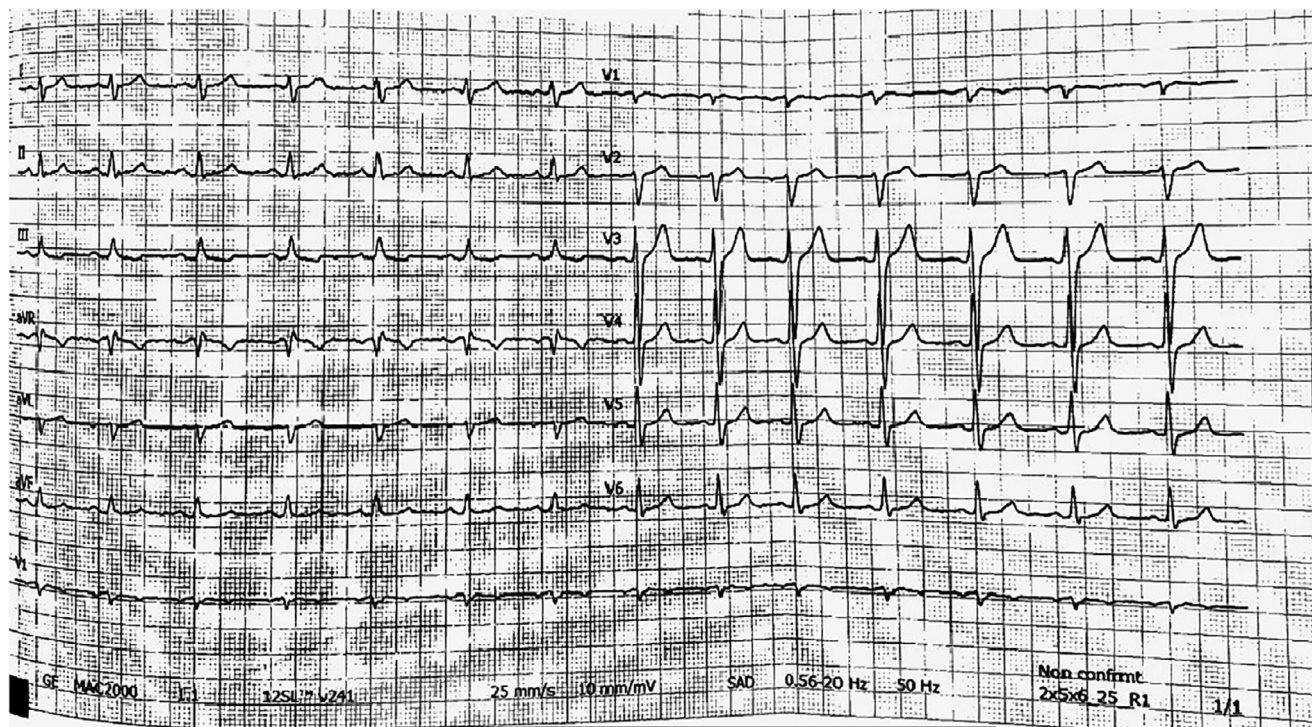
Fig. 1 – ECG recording on arrival at the emergency department, showing sinus rhythm and no significant abnormalities.