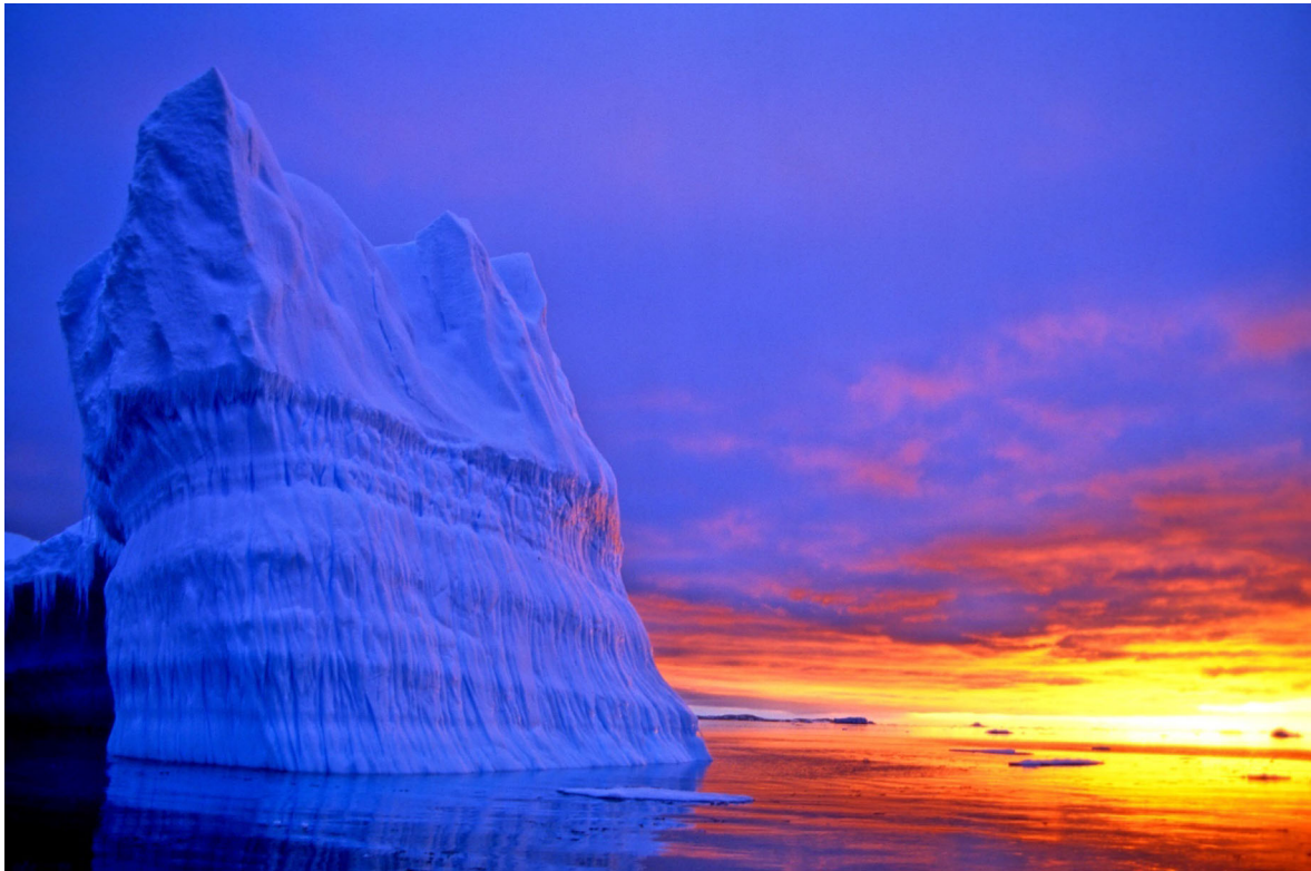
Table 4 Pollution disproportionately impacts first nations people. To the Inuit Greenland peoples, pollution from the Outer World presents a vast array of challenges. Documented here is a firsthand account of some types of pollutants in Greenland and impacts these have on Inuit communities. We have the capacity to influence pollution impacts on a local scale, but we require political efforts, legislation, and global change to make positive impacts in communities and environments in need.

Year in the Greenlandic Inuit language is ukioq, which is actually the same word for winter. Winter lasts most of a year. There is snow and there is ice, saltwater ice and freshwater ice, snow covered ice and icebergs. White in varying shades depending first and foremost on the angle and intensity of incoming light, be it stars, moonlight, the sky, clouds, northern lights – yes, and of course the sun. There are periods in winter and in late fall where the sun is low that give these reddish nuances at first sunrise and late sunset, similar though different, that give you flaming reddish icebergs. In overcast weather the same icebergs can radiate beautifully blue nuances. Such a description depicts pristine nature, literally clean in all aspects of the word. The air is very low on humidity the further north of the arctic circle you get. That feels fresh and clean, too