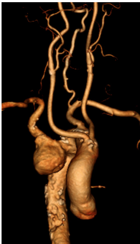
Figure 1: CT Reconstruction Illustrating Kommerell's Diverticulum and an Aberrant Right Subclavian Artery