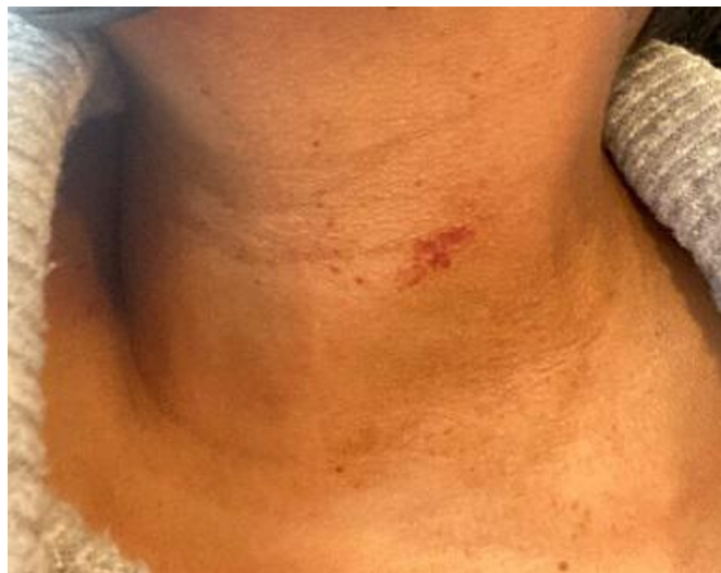
Figure 1 Petechial rash.

pregnancy test and serum lactate that was transiently elevated on HD 3 to 3.3 mmol/L (0.7–2.0 mmol/L) but normalised to 1.9 mmol/L by HD 5. An abdominal ultrasound with Doppler showed normal liver and spleen morphology with no identifiable thrombus. On HD 4, a liver biopsy was performed showing no granulomas, steatosis or evidence of necroinflammatory injury. The patient was started on N-acetylcysteine (NAC), though acetaminophen and salicylate levels were unremarkable. Her total bilirubin peaked at 2.1 mg/dL (0.2–1.2 mg/dL) on HD 3, with mixed component of direct and indirect bilirubin. On HD 5, her total bilirubin was normal at 1.1 mg/dL, AST and ALT improved to 175 U/L and 763 U/L, respectively. Given her normal platelet count and improving transaminitis, the patient was discharged with outpatient follow-up on HD 5.