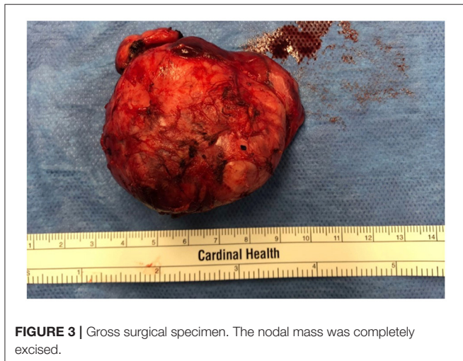
FIGURE 3 | Gross surgical specimen. The nodal mass was completely excised.

*KD, Kimura Disease; ALHE, angiolymphoid hyperplasia with eosinophilia; IgG4-RD, Immunoglobulin G4-related disease; L-HES, lymphocytic hypereosinophilic syndrome.