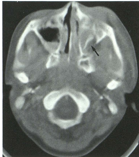
Fig. 1. X-ray computed tomography scan. Fracture of the posterior wall of the left maxillary sinus (arrow) is clearly demonstrated.

A 13-year-old girl was brought to Kitasato University Hospital 30 minutes after falling down a flight of steps and sustaining bilateral contusions of the forehead and orbits. On admission, physical examination revealed massive bilateral nasal bleeding. Computed tomography demonstrated a fracture of the posterior wall of the left maxillary sinus (Fig. 1), a fracture of the greater wing of the left sphenoid bone, and blood in the left ethmoid, sphenoid,