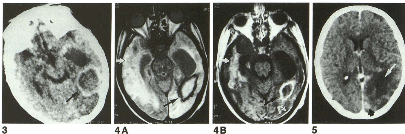
Fig. 3. Nonenhanced CT scan obtained 1 month before stereotactic aspiration. Low-density lesion with hyperdense peripheral rim (arrow) in the left parietooccipital region (the right temporooccipital lesion is not visible on this section).

As in Cox et al's case the center of the lesion in our case probably represented coagulative fungal necrosis, because it was present in the center of the cavity at the time of stereotactic aspiration. In Cox et al's case, despite the similar CT and MR appearance, there was no enhancement after iodinated intravenous contrast administration, probably because of the short delay (1 day) between the scan and the onset of symptoms.