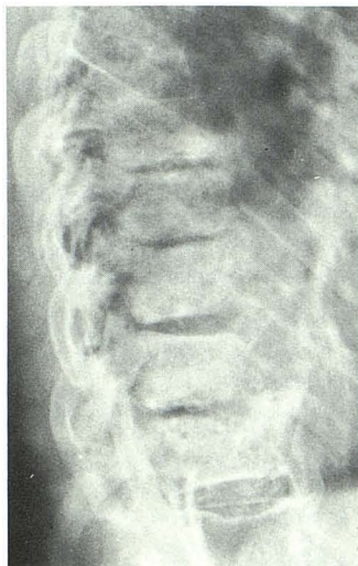
Fig. 2.—Charcot spine, case 2. Radiograph 34 years after injury shows that peridiskal portions of T11 and T12 vertebral bodies have been destroyed, and that subjacent bone is dense. Early neuropathic changes are seen at higher spinal levels.

Feldman et al. [4] pointed out several other difficulties in the radiographic documentation of neuropathic disease of the