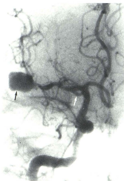
Fig. 1.—Case 1. Anteroposterior view of right carotid angiogram. Fenestration ( white arrow ). Aneurysm arising from bifurcation of MCA ( black arrow ).

present. Computed tomography (CT) demonstrated an intracerebral hematoma in the right temporal lobe, and right carotid angiography showed an aneurysm arising from the bifurcation of the right MCA and a fenestration at the origin of the same MCA (fig. 1). At surgery marked arteriosclerosis in the vicinity of the aneurysm was found. The aneurysm was clipped at its neck. The fenestrated artery at the origin of the MCA was not exposed surgically.