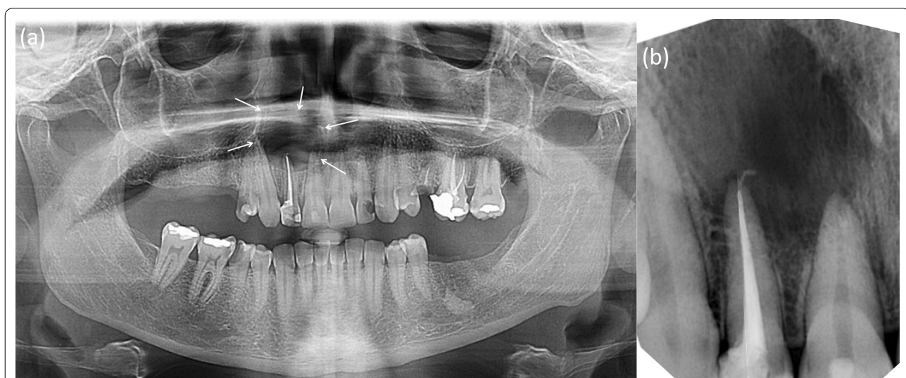
Fig. 1 Radiographic x-ray taken after root canal treatment on tooth 12. a Panoramic radiograph showing radiolucency extending from tooth 13 to 11 (arrows) b Periapical radiograph. Note the normal pulpal morphologies of teeth 13 and 11

Clinical examination revealed a grossly decayed upper right lateral incisor (FDI tooth no. 12). The labial vestibular mucosa and the palate surrounding the tooth apex were compressible but not tender to palpation, indicating that they were undermined with no underlying cortical bone plates. Panoramic view radiography (Fig. 1) revealed a large well-defined radiolucent area extending from the distal of tooth 13 to the mesial of tooth 11 and resembling a "through-and-through" bone