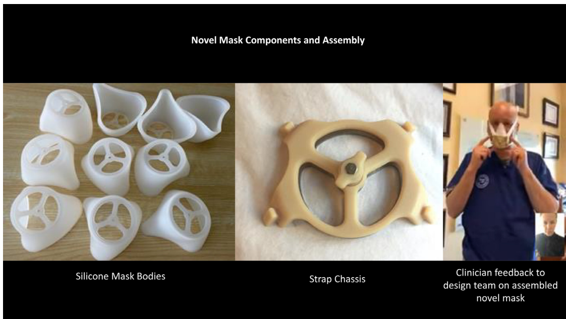
Fig 2. Novel mask components and assembly.

Components would need to be manufactured at scale from raw materials from disparate industrial production companies not traditionally engaged in creating PPE for health care workers. These fell outside of traditional business-to-business relationships with the health system, and connections were facilitated by the engineering component of the design team. The initial design would need to undergo tool and die making, entailing an upfront cost, followed by per-piece cost driven primarily by that of the raw material with manufacturing discounts at volume thresholds. Simplicity of design