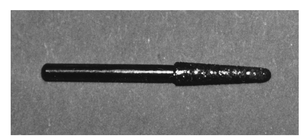
Fig 1. Round-end tapered diamond bur.

In both dogs, the MR images showed considerable artifacts in the second premolar regions of the mandible (Fig 2A). The artifact in the right lower premolar region was larger than that in the left. The right premolar region in the mandible produced the same large artifact even after the crown was removed (Fig 2B). The full-cast crown cemented onto the anterior tooth did not produce a significant artifact on MR images. Histopathologic examination detected foreign bodies, so-called bur fragments, in the gingiva (Fig 2C). The right premolar region (subgingival preparation) showed more bur fragments than did the left region. X-ray fluorescent element analysis of the right premolar region showed iron fragments, presumably from the bur tips in the gingival tissue.