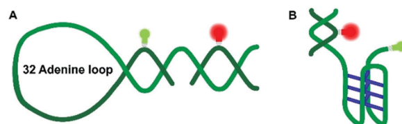
Fig. 1 Schematic representation of the DNA Hp (A) and the hTel i-motif construct (B). The C–C + H-bonds are shown in blue. The green and red bulbs represent the donor dye ATTO 550 and the acceptor dye ATTO 647N used in the smFRET experiments.

Many intracellular assemblies and processes rely on weak, often also transient interactions, sometimes collectively termed quinary interactions. 22,23 They are generally highly susceptible to variations in their environment and respond sensitively to changes in temperature, pressure, pH, and the local concentration of surrounding cosolutes. Perturbation of the volume of the system, e.g. by applying osmotic or hydrostatic pressure, is particularly suited to detect and measure such weak interactions. 24–28 Volume changes are generally a very mild perturbation that happen, for example, during cell-cycle changes or