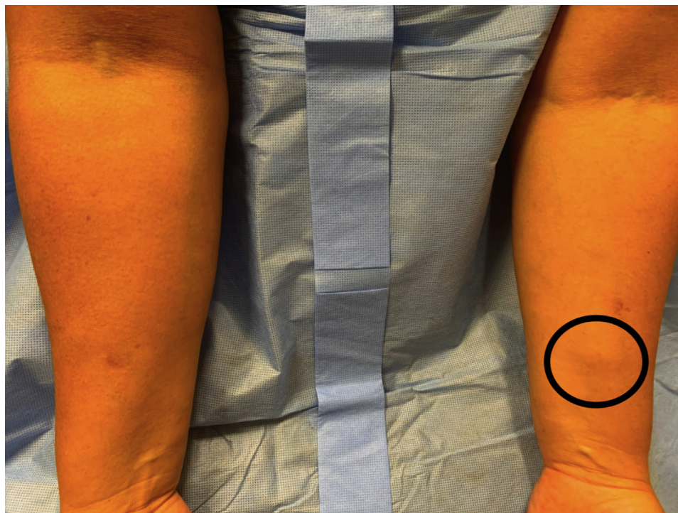
Fig 2. Clinical image of lipoma before treatment.