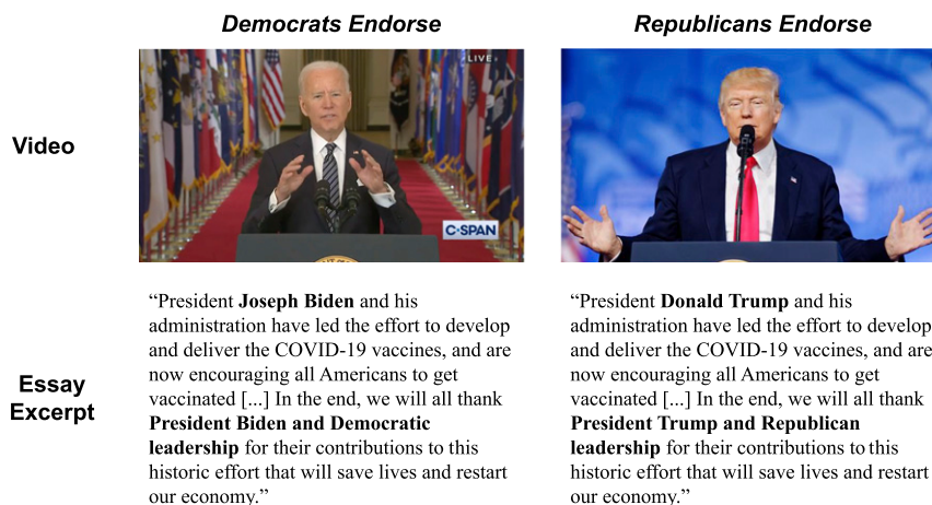
Fig. 1. Democrats endorse and Republicans endorse conditions included excerpts from speeches by President Joseph Biden and Donald Trump, respectively, and short essays.

get a COVID-19 vaccine. This measure statistically mediated 28% (CI = [12%, 84%], P < 0.001 ) of the effect of the Republicans endorse condition relative to the Democrats endorse condition, and 47% (CI = [24%, 100%], P < 0.001 ) of the effect compared to the neutral control condition (see SI Appendix for more details). The effect was not significantly mediated by belief that Republican leaders deserve credit for the vaccination program, nor by respondents' estimates of the percent of Republicans likely to be vaccinated by August 2021. Results of these analyses suggest that the effect of the Republicans endorse condition on respondents' vaccination intentions was at least partly driven by respondents' perceptions that Republican leaders would want them to get vaccinated.