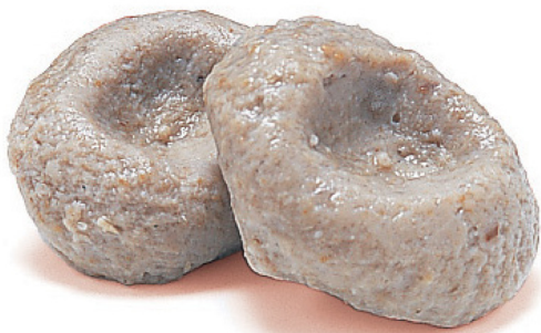
Fig. 1. Fish paste product KIBUN tsumire.

Commercial KIBUN tsumire (Fig. 1) was lyophilised. In brief, minced fish, surimi (20 % sardine, 5 % horse mackerel, 15 % pollack and 15 % blue shark), were ground with starch, salt, plant protein, egg white and other ingredients. Mixed fish paste was shaped into a ball-like formation (35 mm × 45 mm) and boiled at 85 °C for 15 min. The breaking strength