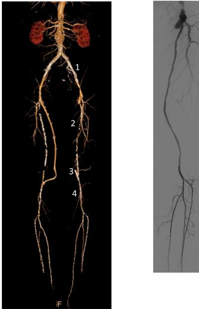
FIGURE 1 Case 1: Preoperative CT angiography showing the occluded left-sided bypass with (A) patent stents in CIA and EIA, (B) occluded above-the-knee and occluded below-the-knee bypasses, (C) occluded stent at distal anastomosis of above-the-knee bypass, (D) patent self-expandable stent in PA. Postoperative angiography showing the relined occluded above-the-knee prosthetic bypass