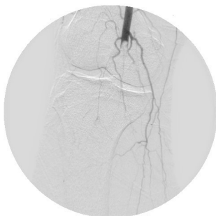
Figure 1 Right lower extremity angiogram on day 6 showing acute thrombosis of the right popliteal artery.

In a study on patients with COVID-19 pneumonia who developed acute limb ischaemia, revascularisation was successful in 12 of 17 (70.6%) patients who underwent operative treatment. 4 The lower-than-expected revascularisation success rate could be due to a link between COVID-19 and hypercoagulable state, leading to increased risk of arterial occlusion. The mechanism by which COVID-19 infection predisposes patients to thromboembolic events is poorly understood. A myriad of factors including overwhelming inflammatory response or ‘cytokine storm’