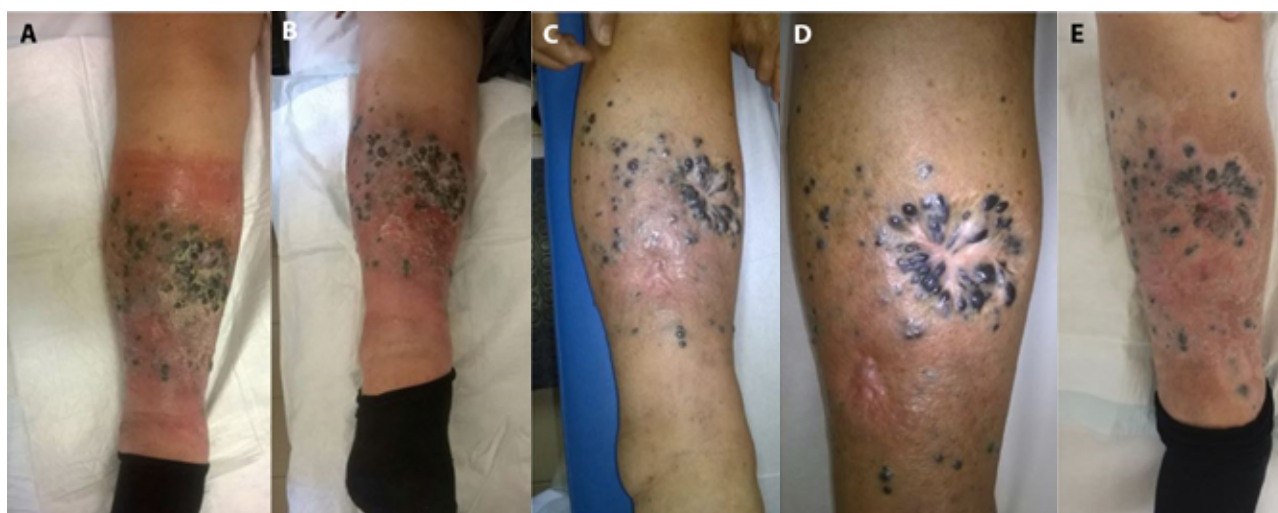
Figure 4. (A) Pattern of response following immune therapy in a patient with multiple in-transit skin metastasis localised in the lower limb. (B-D) Response developed during 1 year of treatment with induction of inflammation. (E) Immune activation around the skin metastases, towards complete clearance confirmed at histology with development of peri-lesional vitiligo.

RR= response rate; CR= complete response